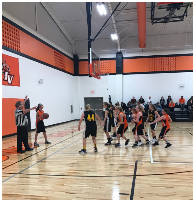
First game played in the new gym on December 5, 2017