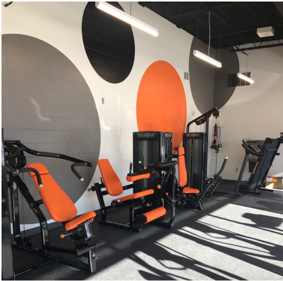
Strength conditioning equipment